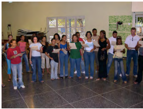
Musical group in preparation of the Cultural Manifestation for Her Majesty Queen Beatrix July 2005