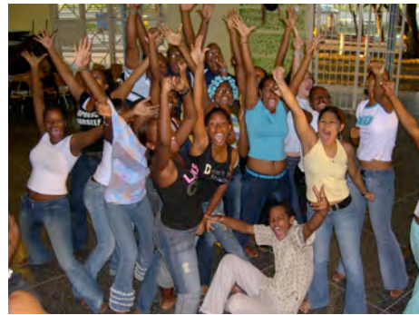
Group of youngsters during the training for the Cultural Manifestation for Her Majesty Queen Beatrix July 2005