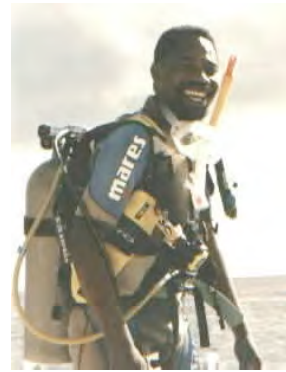
The Underwater world documentary